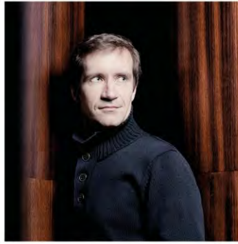
Nikolai Lugansky