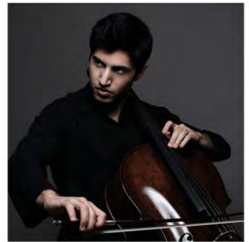
Kian Soltani ©Juventino Mateo