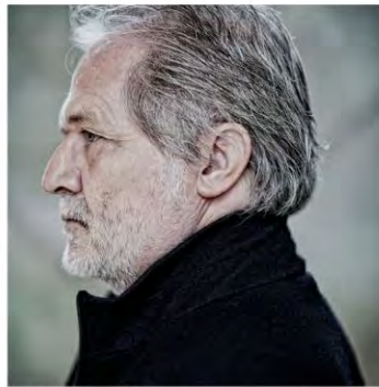
Péter Eötvös