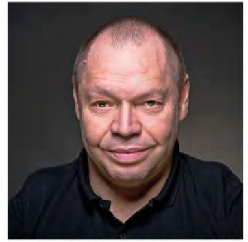
Thomas Quasthoff