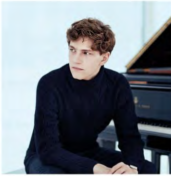
Jan Lisiecki