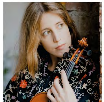
Vilde Frang