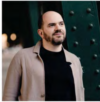
Kirill Gerstein