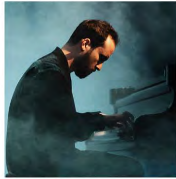
Igor Levit