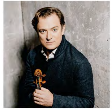
Renaud Capuçon ©Marco Borggreve