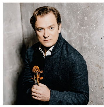
Renaud Capuçon @Marco Borggreve