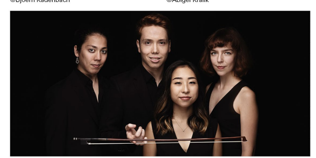
Leonkoro Quartet string quartet