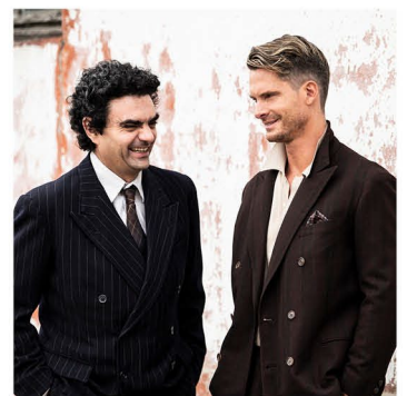
Rolando Villazón / Xavier de Maistre