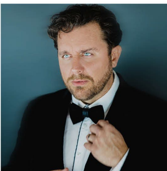
Michael Spyres