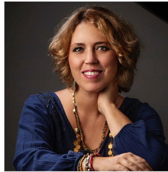
Gabriela Montero