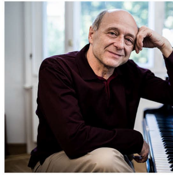
Iván Fischer