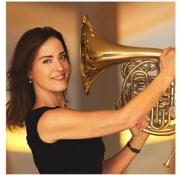
Sarah Willis