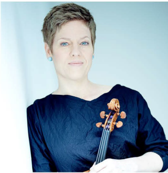
Isabelle Faust