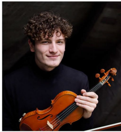
Benjamin Günst Violine © Santiago Kuhl