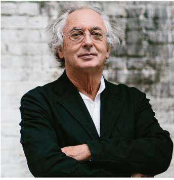
Philippe Herreweghe