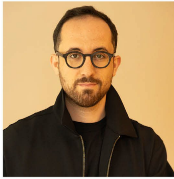
Igor Levit